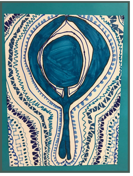
View first grade penguins and other art from Ridgebury's show.